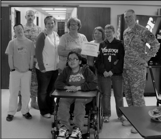
WAC accepts appreciation award from Co-A 213 Brigade Support Battalion.

During the epic flood fight of 2011 the Work Activity Center staff and individuals wanted to come up with a way to lend a helping hand. Ideas were tossed around and we decided filling the stomachs of the hard workers who were keeping our town high and dry was a great way to contribute. Staff and individuals got busy and delivered a roaster full of barbeque, buns, cookies, chips, and bars to three different locations.